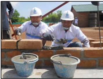
ANZ Volunteers 2010

All the staff at Habitat for Humanity Cambodia would like to give a special thanks to ANZ Royal Bank for their continued support and we look forward to continued partnership with our corporate donors.