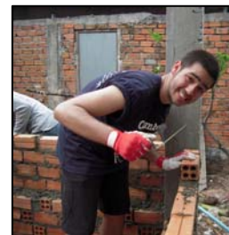
Master Brick Layer