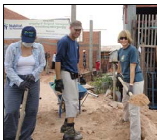
US Embassy Team Work