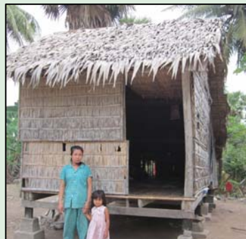
Beneficiary posing in front of their old house