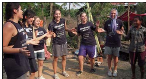
Taking time for song and dance