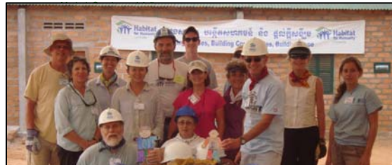
US Team Photo