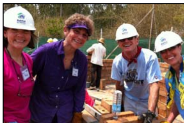
Team USA Smiles!