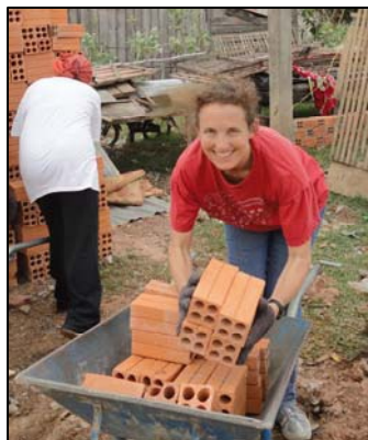
Building muscles while carrying bricks