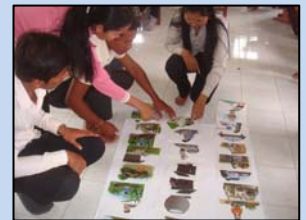
PHAST workshop in Siem Reap

In order to increase the capacity and understanding of Sanitation Action Groups (SAG) and School Water Sanitation and Hygiene (S. WASH) groups in Siem Reap, HFH Cambodia staff conducted a Participatory Hygiene and Sanitation Transformation (PHAST) Training Workshop in Cha Chhuk commune on 22-23 March. During PHAST trainings, participants are educated on understanding and identifying health problems and how to perform evaluations on hand washing; latrine construction and use; and safe drinking water.