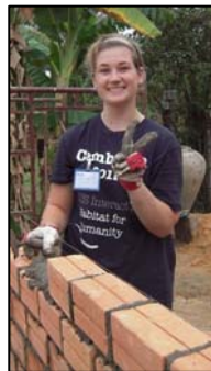
Peace and brick laying