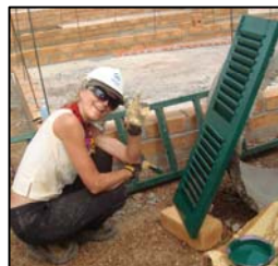
Painting the Shutters