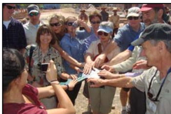
US Team giving away the key to the house