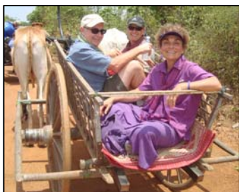
Relaxing during an ox cart ride

If you would like to make a difference and volunteer with Habitat for Humanity Cambodia as a Global Village volunteer, visit this site for more information: http://www.habitat.org/gv/