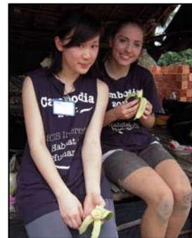
Taking time for a break