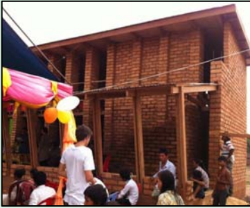
Dedication Ceremony in Sra Pou Village