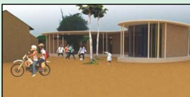
Community Center Design

A community center is in the planning process for the New Holistic of Hope community in Oudong. On 20 April a design meeting was held at the HFHC Phnom Penh office including HFHC construction staff, Asia/Pacific staff and two freelance architects. At the meeting the community centers design from top to bottom was discussed.